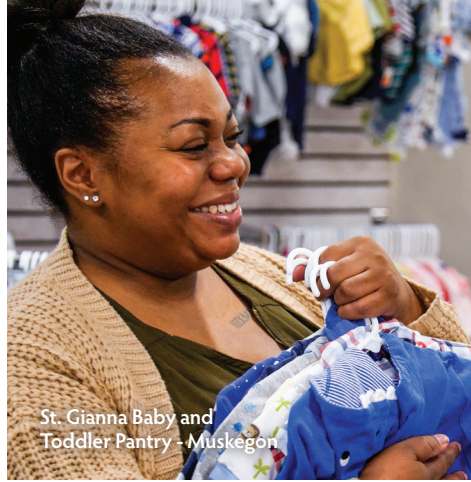
St. Gianna Baby and Toddler Pantry - Muskegon