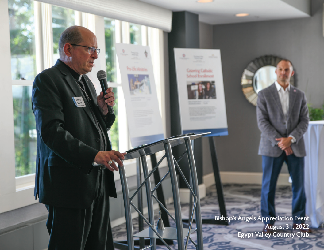
Bishop's Angels Appreciation Event August 31, 2022 Egypt Valley Country Club